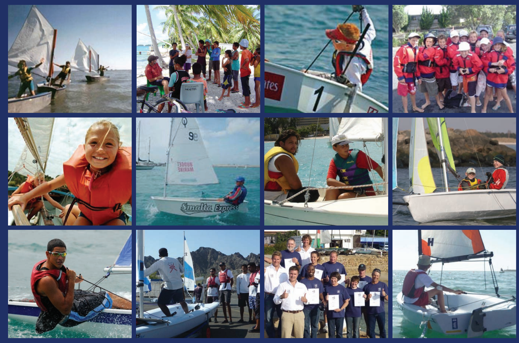
OUR MEMBERS - OUR PARTNERS - OUR PROCESSES - OUR PEOPLE

In many countries, the sport of sailing is still inaccurately perceived as being of an elitist nature; a notion which not only denies many the pure enjoyment of competitive sailing but deters potential business partnerships from developing. This document sets out to dispel that notion and with the Connect To Sailing Programme, outline the commercial opportunites through varying degrees of active participation.